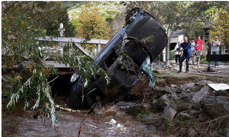
SUBMITTED BY MIKE MITCHELL

In the event of flooding, the city’s services will be stretched thin. Be prepared. Review your plan for El Niño now.