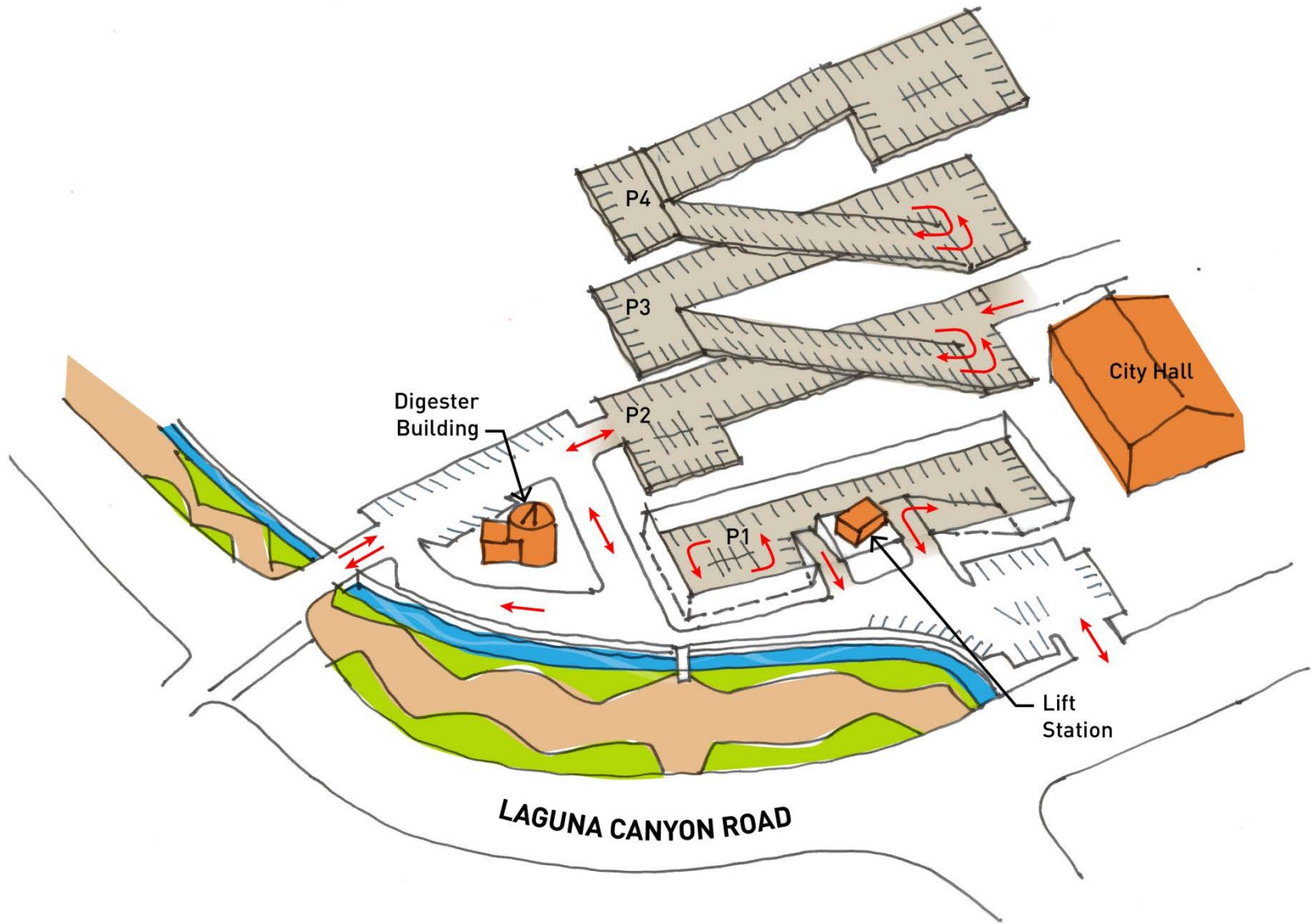
Parking Structure Circulation Diagram