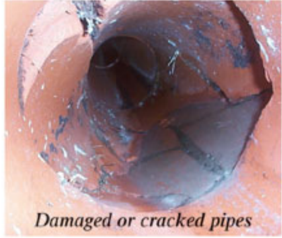
Damaged or cracked pipes

A private lateral that is structurally damaged and may also have separation of the pipe joints upstream or downstream of the problem.