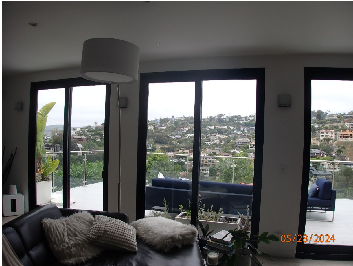
1008 Van Dyke Drive

The photograph above was taken from the living room on the main level of the primary residential structure.