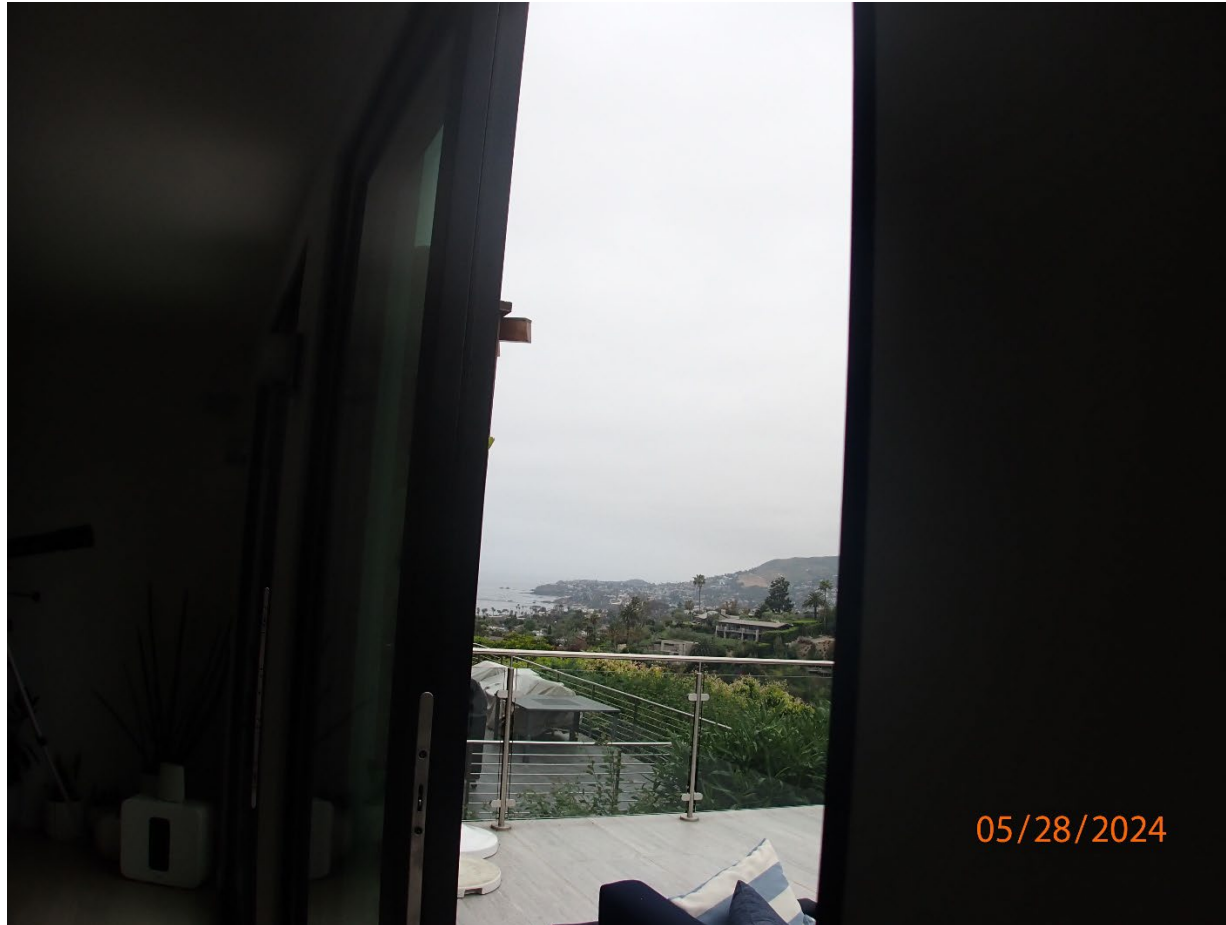
1008 Van Dyke Drive

The photograph above was taken from the living room on the main level of the primary residential structure.