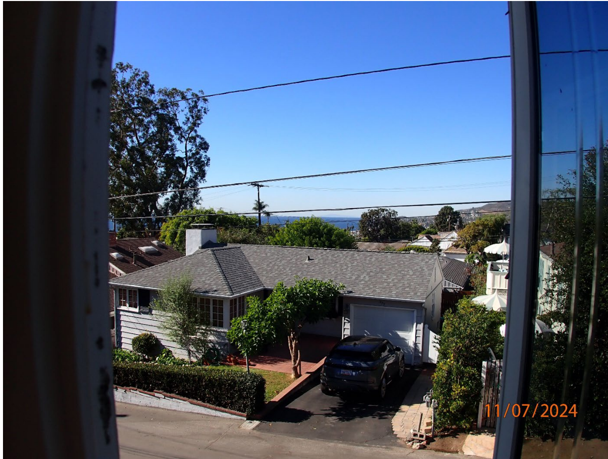
383 Osgood Court

The photograph above was taken from the dining room area on the upper-level of the primary residential structure.