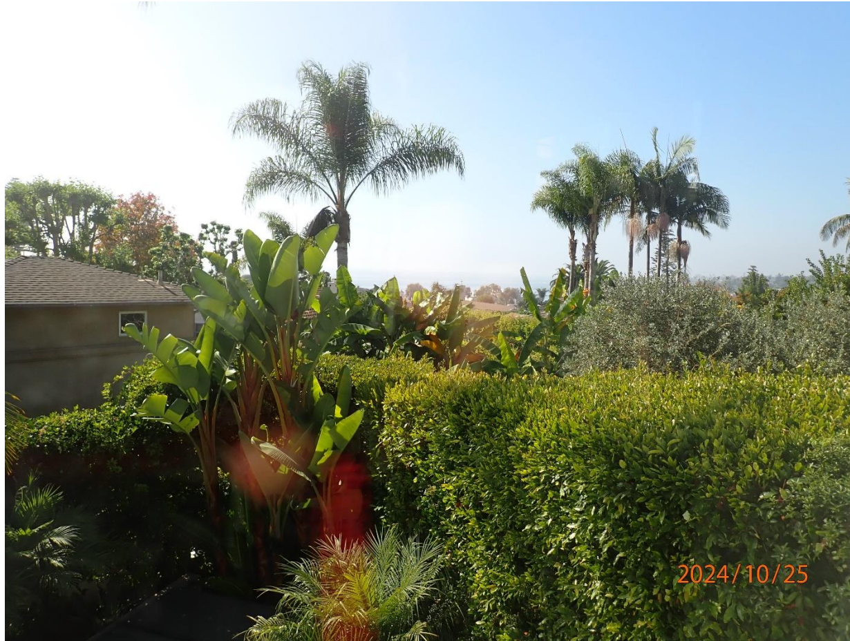
615 Short Street

The photograph above was taken from the office on the upper level of the primary residential structure.