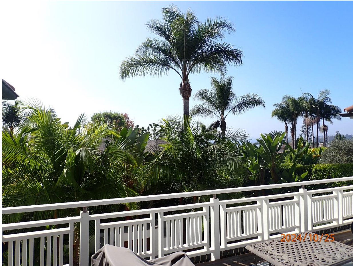
615 Short Street

The photograph above was taken from the master bedroom on the upper level of the primary residential structure.